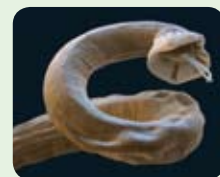
Adult A. vasorum lungworm These live in the heart and pulmonary arteries

Lungworm infestation, caused by the parasite Angiostrongylus vasorum is something that all dog owners should be aware of. Angiostrongylus vasorum can cause a wide range of symptoms – some severe, including coughing, lethargy, fits and blood clotting problems. However other pets may show no obvious signs of problems.